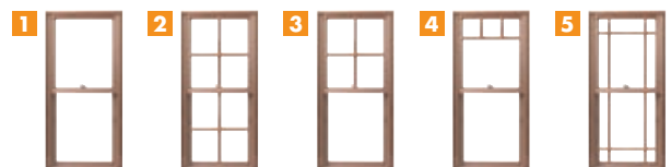
1 Standard 2 Colonial Bar 3 Colonial Bar 4 Heritage Bar 5 Federation Bar

The Counter Balance window is effectively a vertical sliding window that offers a combination of the look of weights and cords and a modern Counter Balance system which utilises the weight of one sash to counter the weight of the other.